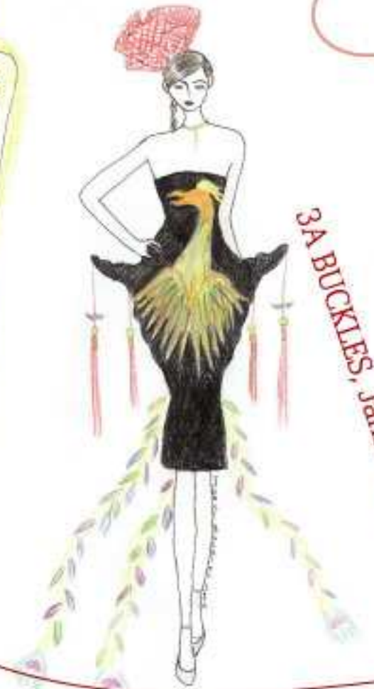
3A BUCKLES, Jansi Tang 華鄧展思