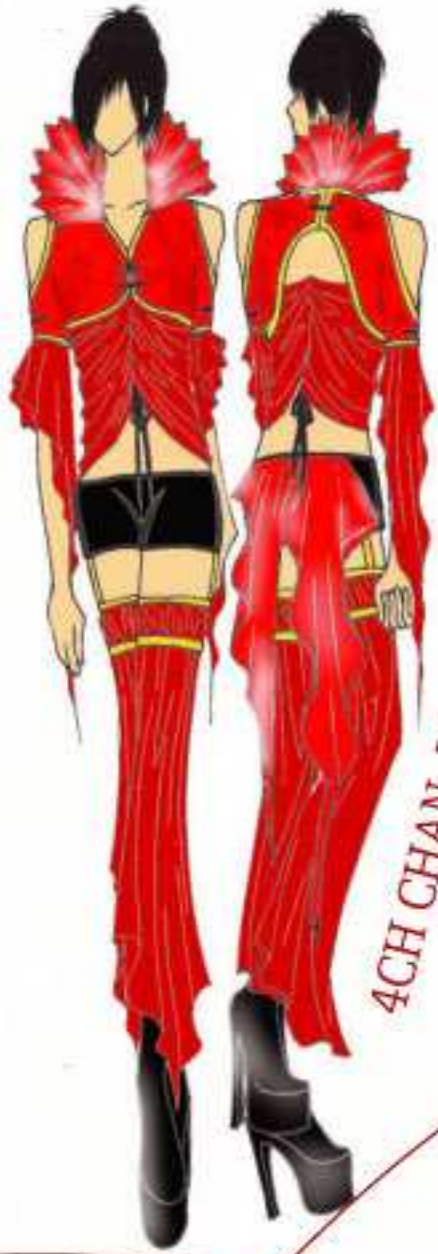
4CH CHAN, Wing Man 陳詠敏