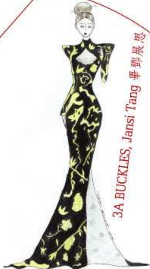
3A BUCKLES, Jansi Tang 鄧展思