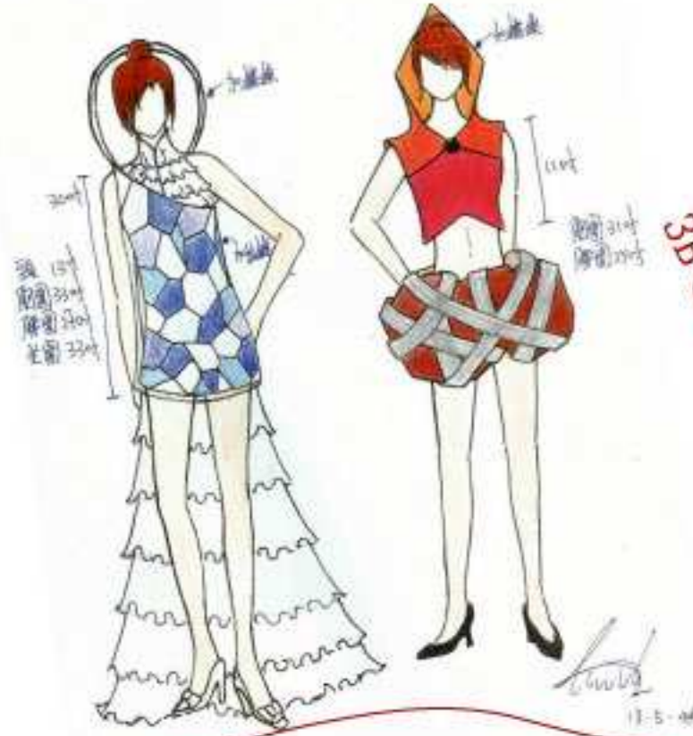
3B CHU, Cheuk Ling 朱焯齡