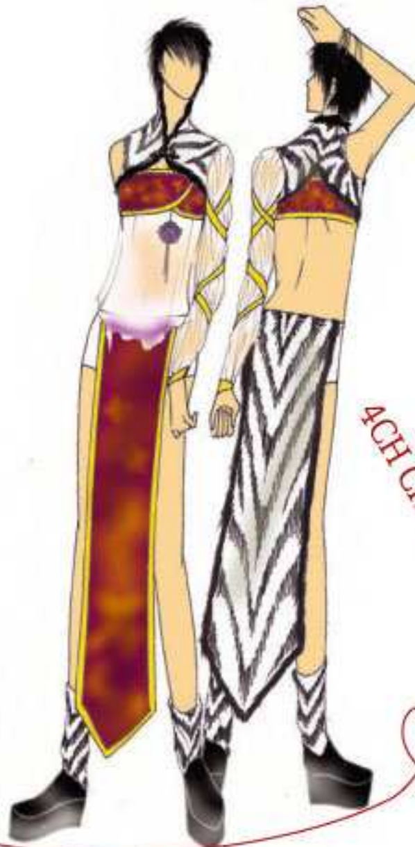
4CH CHAN, Wing Man 陳詠敏