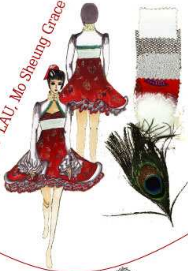
4FH LAU, Mo Sheung Grace 劉慕榮