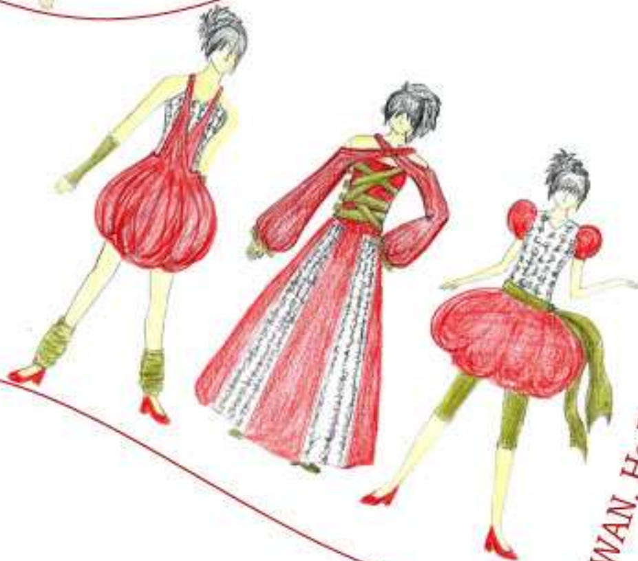
2A WAN, Ho Tung 尹可彤