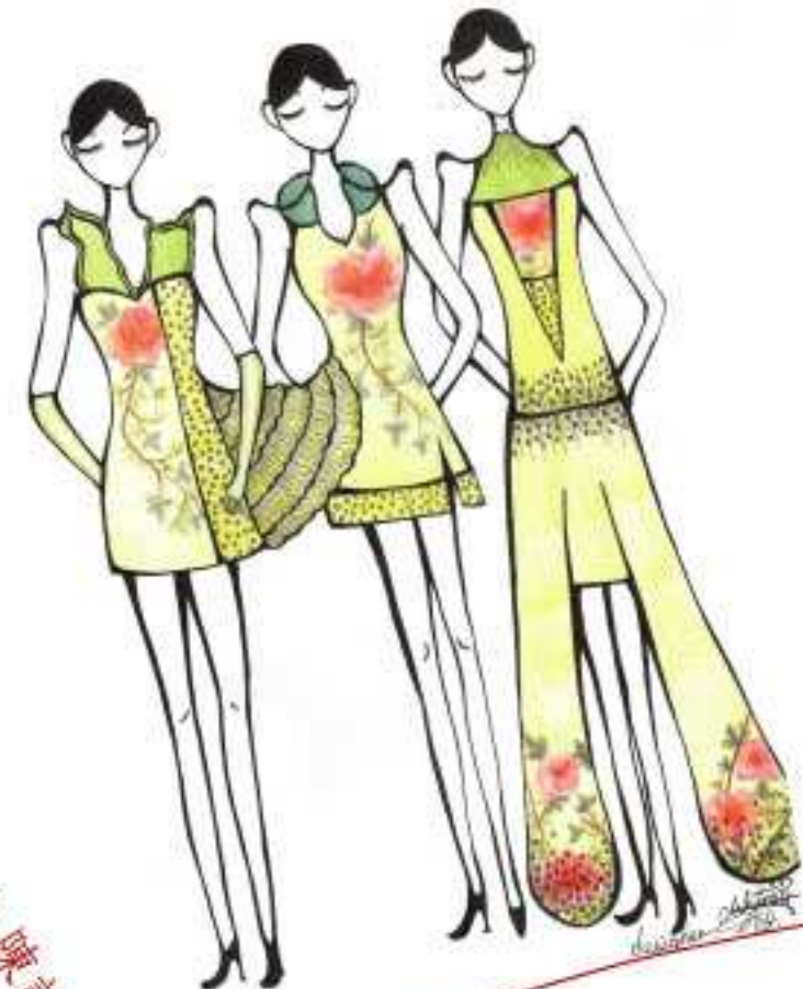
3D WONG, Sze Ting 黃詩婷